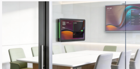
Glass Wall Mount