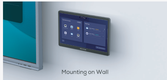
Mounting on Wall