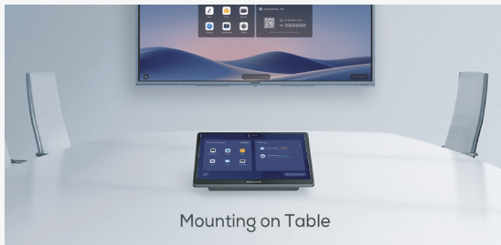
Mounting on Table

Whether placed on the desk or wall-mounted for specialized setups, the TCP30M adapts to your room's layout.